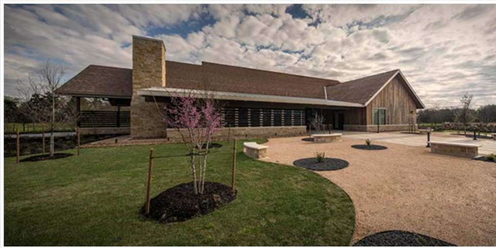
San Felipe de Austin Museum Exterior