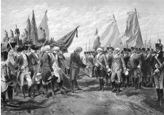
Cornwallis Surrenders at Yorktown

On October 19, 1781, British General Charles Cornwallis surrendered his army of some 8,000 men to General George Washington at Yorktown, giving up any chance of winning the Revolutionary War. Cornwallis had marched his army into the Virginia port town earlier that summer expecting to meet British ships sent from New York. The ships never arrived.