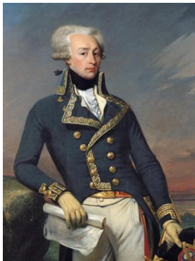
Gilbert du Motier, Marquis de Lafayette

The Marquis de Lafayette led Continental troops and Oneida allies, under his command, in avoiding a trap that had been set by the British. Select soldiers and Oneida fought a rearguard action to stop the British from advancing, allowing Continental troops to avoid capture. Barren Hill was later renamed and now is called Lafayette Hill.