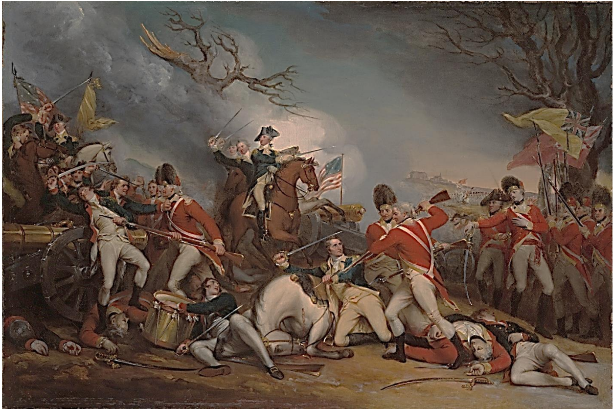
The Death of General Mercer at the Battle of Princeton, January 3, 1777, with Captain William Leslie, by John Trumbull - Yale University Art Gallery.

https://www.nps.gov/revwar/revolution_day_by_day/1777_main.html