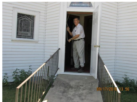
Bells Across America - Louise, Texas