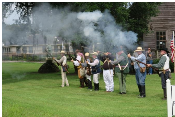
Bells Across America - West Columbia, Texas